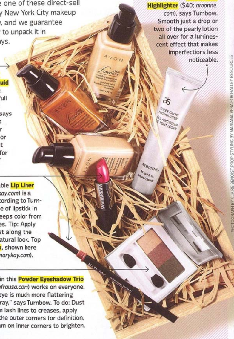
PHOTOGRAPH BY CLAIRE BENOIST; PROP STYLING BY MARIANA VERA FOR HALLEY RESOURCES

✉ ARBONNE Every woman can benefit from the Sheer Glow Highlighter ($40; arbonne.com ), says Turnbow. Smooth just a drop or two of the pearly lotion all over for a luminescent effect that makes imperfections less noticeable.